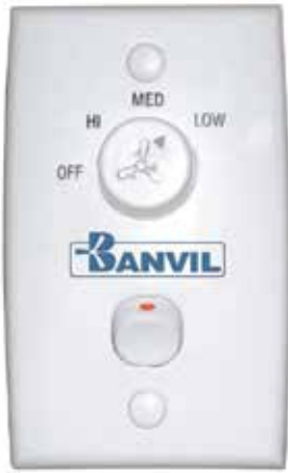
WC103 • church quiet control • 3 speed capacitor • one fan only