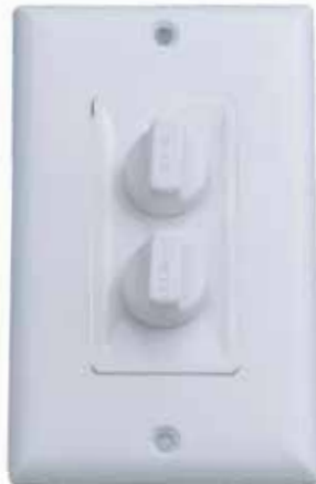
WC100WH • 1.5 amp fan control • 300W light