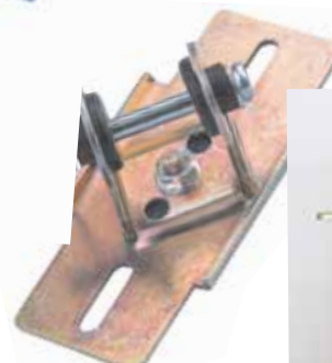
Mount • easy mount