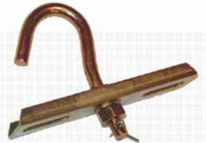
DZ-1 • hook