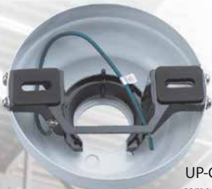
UP-CANOPY • comes with casting bracket