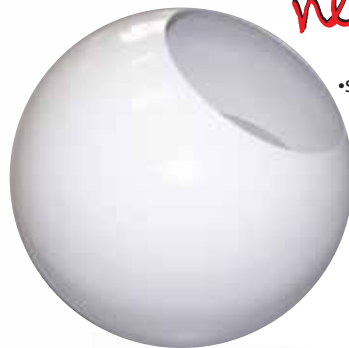
new SCAK • slope ceiling adaptor