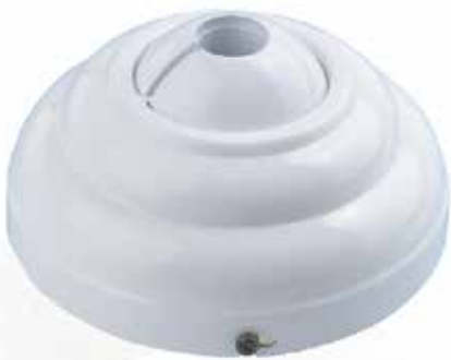
DSLOPEMOUNT • 45" sloping canopy