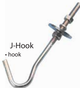
J-Hook • hook