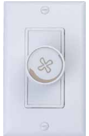
WSC 500W • 500W variable speed control