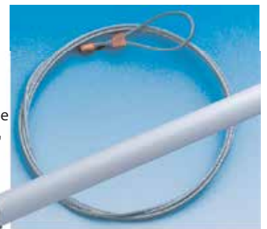
E961 E962 • extension and safety cable • available in 18", 24" & 36"