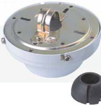
SM-KIT • mounting plate with 1/2" or 3/4" ball plus U bracket for hanging on pipe